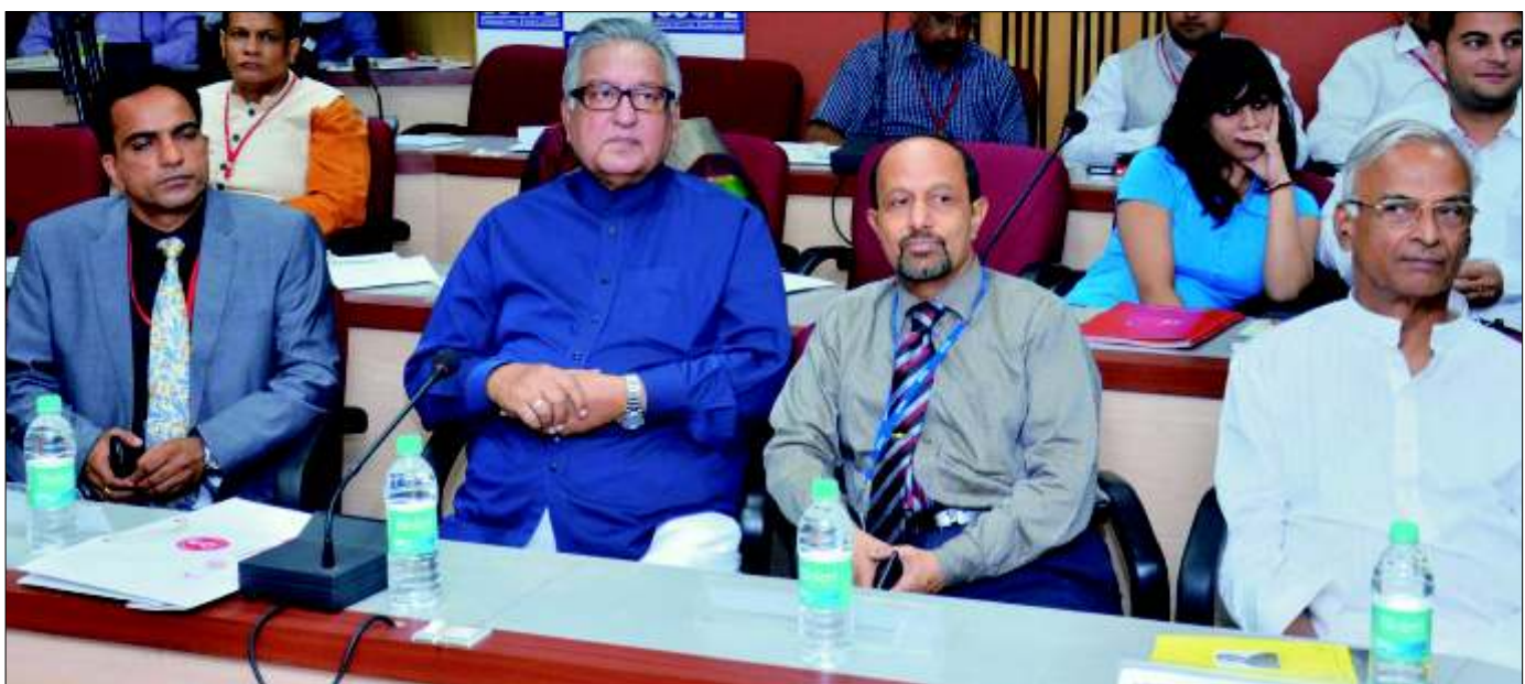
A section of the award jury (front row)