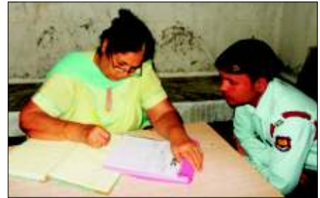
Doctors examining patients at different sites...

To provide free, accessible and quality based primary healthcare services to the construction site workers and their families, DLF-VIVO Mobile Clinics operate two clinics every day - one each in Corporate Green and Sector- 91, Gurgaon. The clinics offer OPD Facilities; Maternal & Child Healthcare; First Aid & Primary Treatment; and Free Medicine Dispense. In the last two months, on an average 32 patients were seen per day, with 807 patients at Corporate Green and 775 at Sector-91,