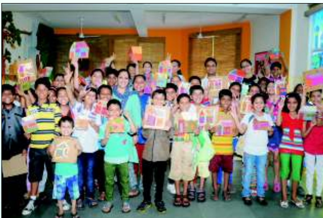
Scholars from classes IV-VI after the session 'Creative self'