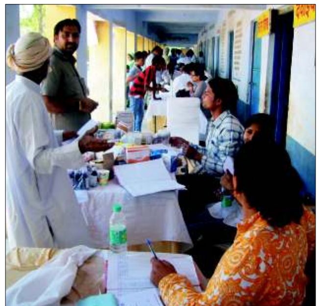
Distribution of medicines at PHCs

All 84 clinics under DLF Primary Healthcare Service (PHC) in 16 villages of Haryana and Punjab functioned smoothly. In the last 2 months, there were 1079 old patients while 1023 new patients registered at the PHCs, out of which about 58% were female and 42% were male.