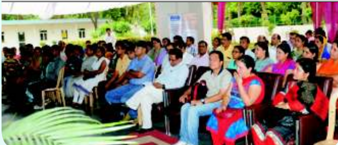
Parents participating in annual meet