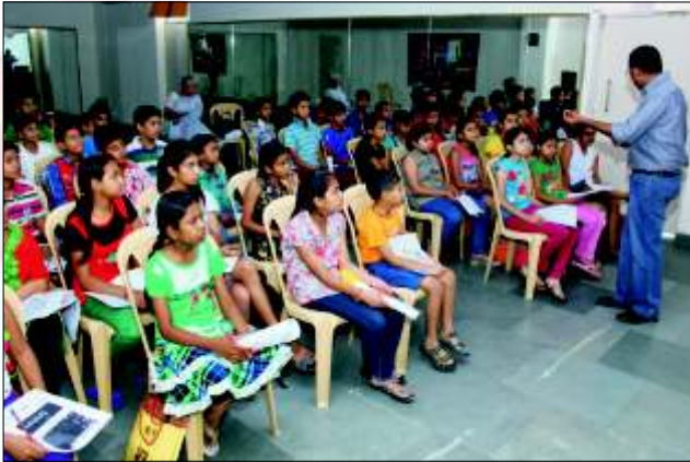
Strengths & self esteem session under progress for scholars of classes VII-IX