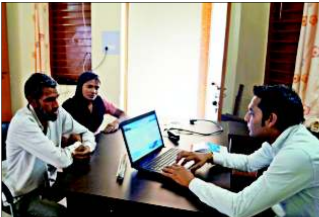
Villagers getting information at the RIC centre

A self-service lounge with computers is also available at the RIC for those who are able to handle requirements with minimal guidance.