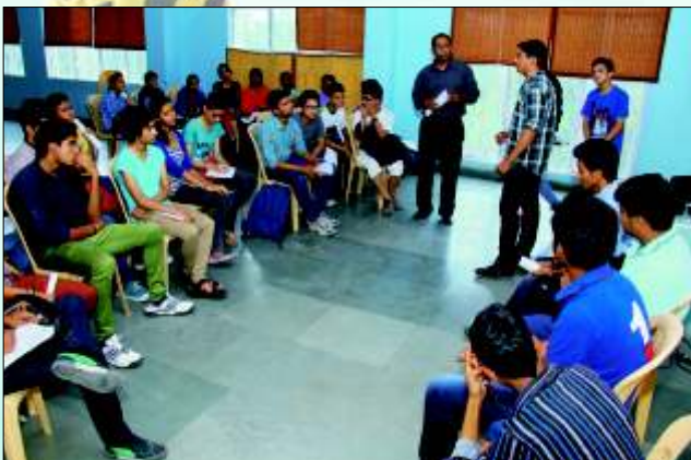
Goal setting & time management session in progress for classes X-XII students