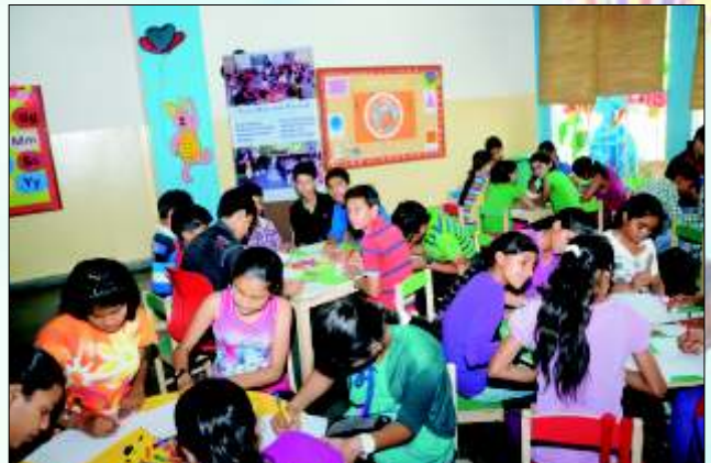
Calligraphy session for classes VII-IX scholars in progress