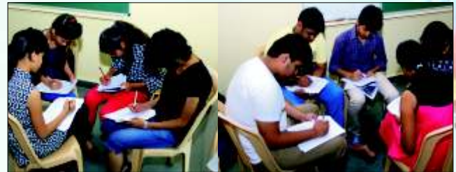
Aptitude testing in progress...

Over 30 scholars of Classes X and XII underwent Aptitude Test and their results were discussed with the Career Counselors in the presence of their parents.