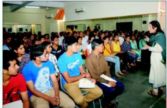
Career guidance & counseling under progress for class X-XII scholars