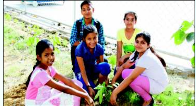
Scholars participating in tree plantation drive

A session was conducted for the students of classes VII to XII to make them aware of the various issues regarding Environment & Climate change. The session was followed by a Tree Plantation Drive and the students planted over 80 silver oak saplings along the school boundary.