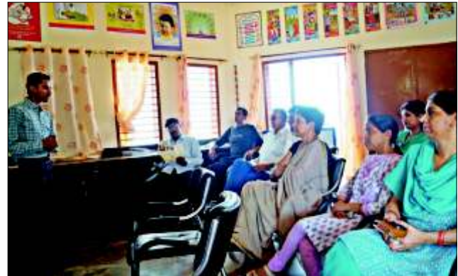
Training the RIC professionals...

The RIC has details of all govt. schemes, employment & career related information, various facilities and