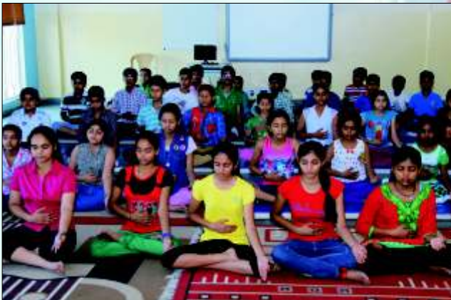
Wellness through Yoga session under progress for scholars of classes VII-IX