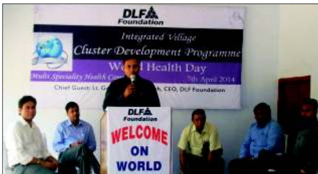
Celebrating World Health Day...